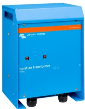
Isolation Transformer 3600W