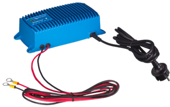
Blue Smart IP67 Charger 12/25